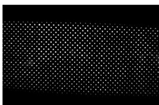
Here, the BL BAR mounted backlight allows continuous quality examination of a web with a linear camera

Discover the BL BAR immediately on www.tpl-vision.net